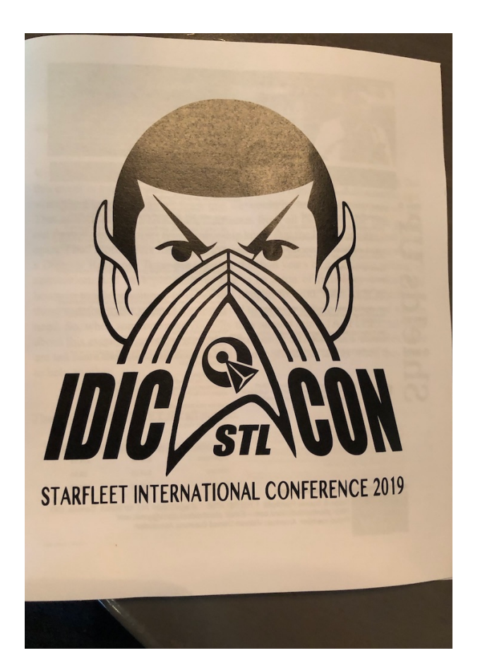
IDIC CON STL 2019