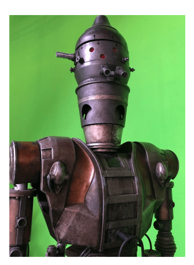
MANDALORIAN IG-88 (MAKING OF STARWARS)