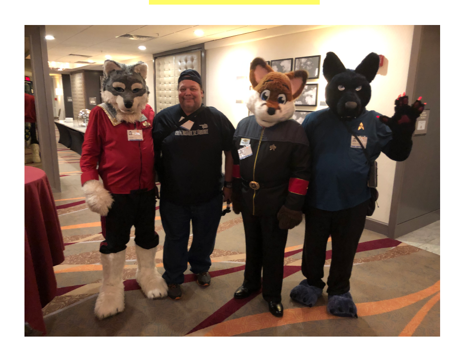
Member of the Month