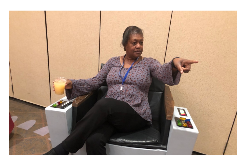
HEY BABY... ENGAGE!